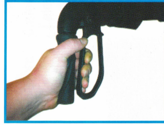
Squeeze to Stop

The braking system is convenient and easy to operate. People who may have hand disabilities should find the brake handles wide, comfortable and non-binding. Minimum pressure needs to be applied to activate the locking loop brake system.