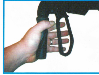
Release to Roll